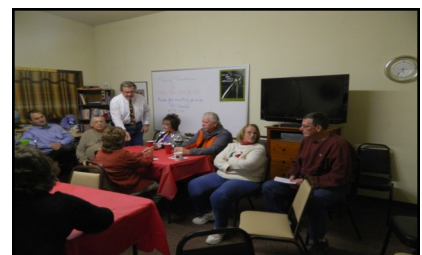
A Christmas event of food, fun and fellowship.

The group brought non-perishable food items which we gave to the Food Bank. Thanks to CASA Staff for delivering the food items.