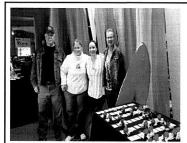
Volunteers attend the Benefit